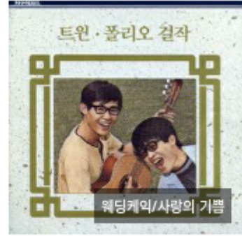
트윈 폴리오 걸작 (웨딩케익의 트윈 폴리오)