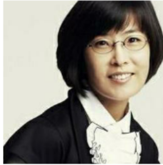
2011년 콘서트 실황 이선희